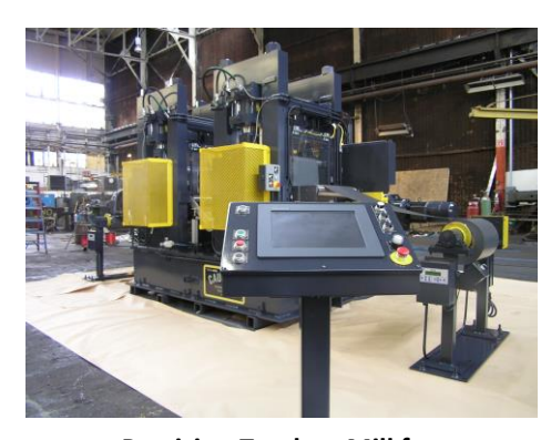
Precision Tandem Mill for Reducing to .001" Thick