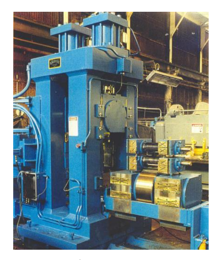
4-High Mill for High Strength Alloys