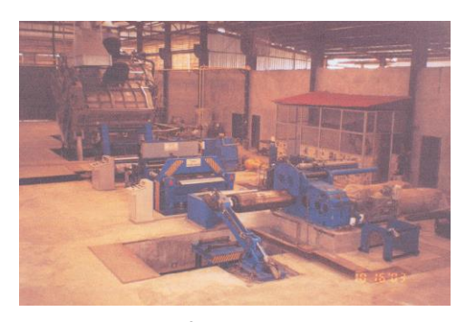
Rolling Mill for Continuous Casting