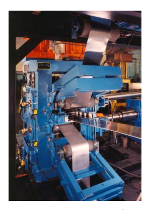
Three-Ply Cladding for Three Layers of Strip