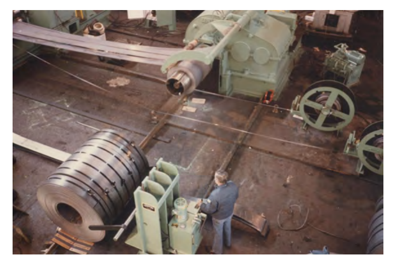
EXIT COIL CAR W/HOLDING FINGERS AND SCRAP WINDERS