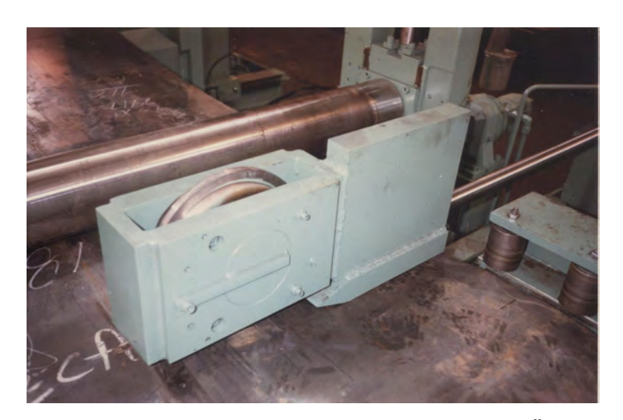
THROATLESS SLITTER TO SLIT MATERIAL FROM 020" TO .500" THICK (REPLACES CROPPING SHEARS IN SLITTING AND ROLL FORMING LINES)