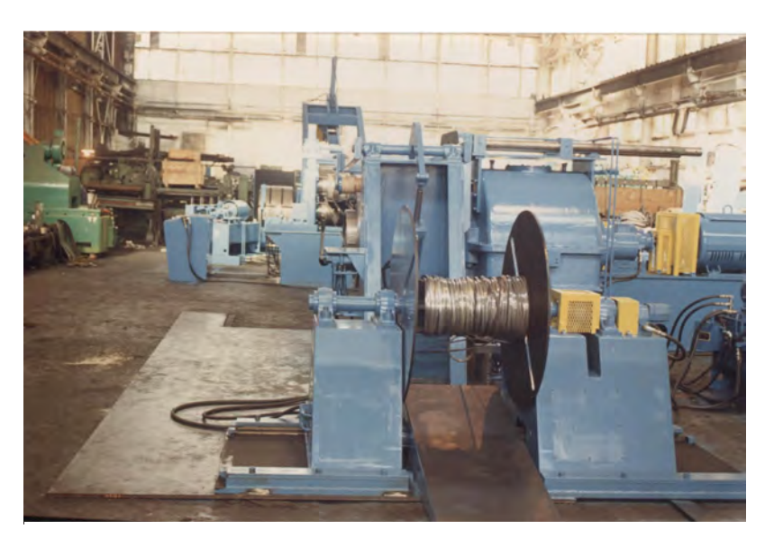
SELF-EJECTING SCRAP WINDERS