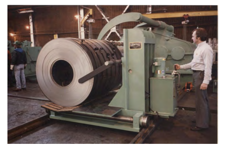
EXIT COIL CAR FROM RECOILER W/HOLDING FINGERS FOR C-HOOK REMOVAL WITHOUT TURNSTILE