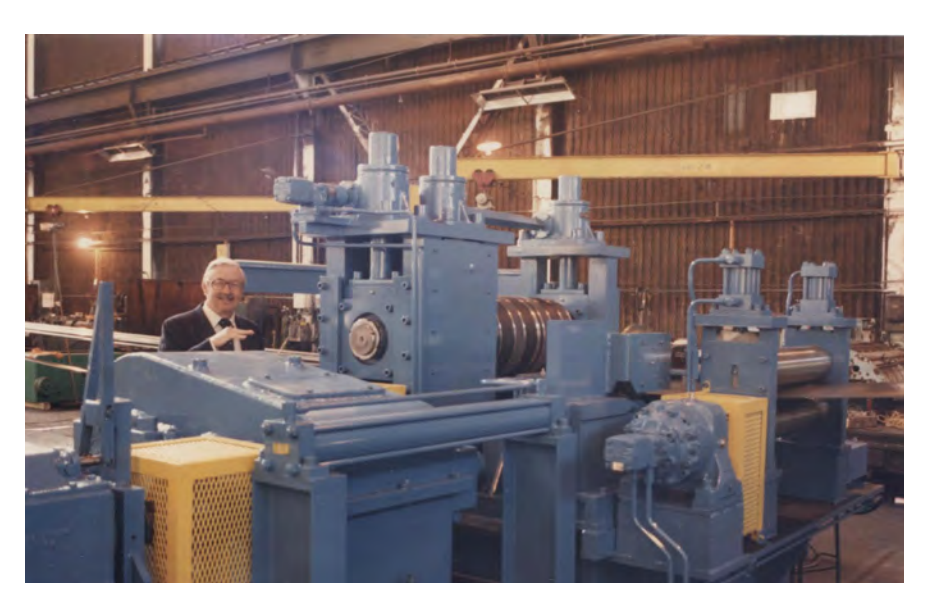
HEAVY GAUGE NARROW SLITTER W/ROTARY CROP SHEAR AND PINCH ROLLS FOR MANY CUTS OF 3/8" IN SINGLE PASS