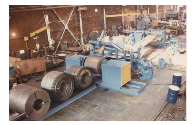
MODERNIZED SLITTING LINE SYSTEM FOR HOT ROLLED STEEL FOR STRUCTURAL TUBE MILL