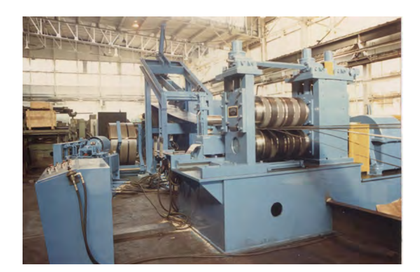
NARROW HEAVY GAUGE SLITTING LINE, 12 CUTS OF .250", ONE PASS, HOT ROLLED STEEL