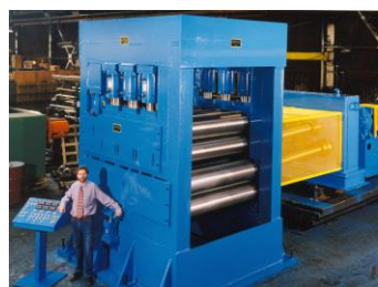
160" x 4" to .250" Plate Leveler