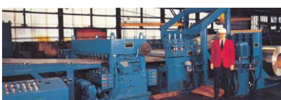
76" x .250" to .020" x 60,000# Double Leveler Cut-to-Length Line