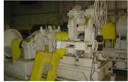
9" Diameter x 12" Wide Lewis 2-High Coil-to-Coil Rolling Mill w/Edging