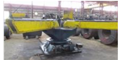
72" x 60,000# Turnstiles, 4-Arm with or without Hydraulic Pushoff

American Steel Products Company 3171 N. Republic Blvd. | Toledo, Ohio 43615 USA Telephone 419.843.6051 | Fax 419.843.5288 sales@americansteel.com | www.americansteel.com