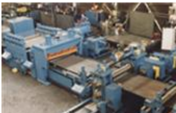
Cut-to-Length Lines: World's largest and fastest systems for maximum productivity.