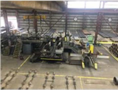
72" x 8" Arbor x 60,000# Delta Slitting Line w/(2) Ejector Heads & Turnstiles