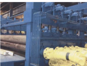
102" x 10" x .625" to .125" Flattener/Leveler