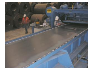
76" x .500" to .062" x 60,000# Single Leveler Cut-to-Length Line