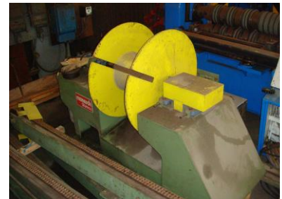
Scrap Winders w/Level Wind, Self-Ejecting, (2) Available