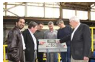
Worldwide Services: Technical support and service on our equipment or yours.