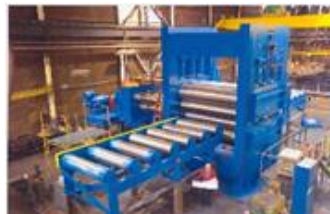
Levelers: Largest in the world - .500" to 7" thick x 168" wide x 6,000 tons of separating force.