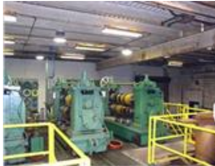
72" x .500" x 10.5" Arbor Quick Change Slitter Heads, (3) Available