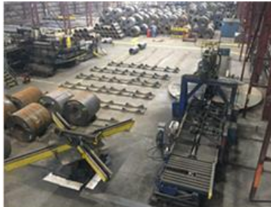
72" Signode Automatic Radial Banding System