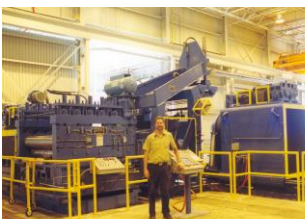
96" x 625" to .125" Cut-to-Length Line w/102" x 10" Backed Up Leveler