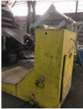
60,000# Capacity Coil Cars