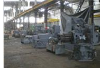
2" x 2" to 6" x 6" x 4.5" Turek & Heller w/Horizontal Shafts