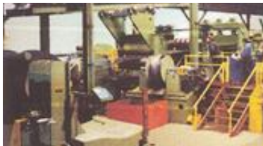
Slitting & Edging Lines: Complete systems and components for processing a wide range of materials.

We clearly understand today's processing needs because we manage our own service centers processing thousands of tons per year. For over 60 years, we have served the industry worldwide. Today our affiliated companies offer more products than ever before.