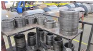
Lots of Tooling Available

sales@americansteel.com | www.americansteel.com