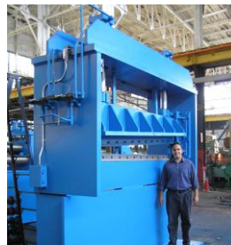
96" Hydraulic Crop Shear