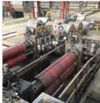
72" x 8" Arbor Slitter Heads, Ejector Type, (2) Available