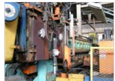
60" Strip Joiner Guild Automatic Strip Joiner, Fully Automatic