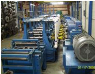
2" x 2" to 4" x 4" Abbey Etna Structural Tube Mill w/Lots of Tooling