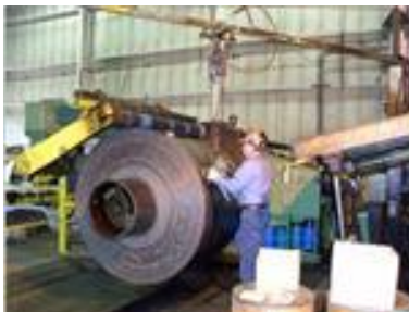
72" x 60,000# Capacity Recoiler, 20" & 24" ID x 300 HP AC to DC Drive