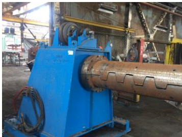
72" x 60,000# Capacity Single-End Hydraulic Expanding Mandrel Uncoiler w/Large Air Brake & Feed Up