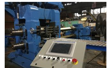
Rolling Mills: 2-high, 4-high, 6-high hot or cold w/quick roll change and computer controlled AGC.