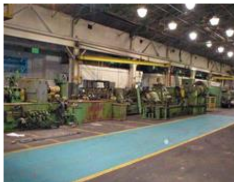
72" x 80,000# Pro-Eco Slitting Line, .500" to .062" Thick w/Ejector Heads & Crop Shears