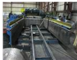
76" x .500" to .020" x 60,000# Double Leveler Cut-to-Length Line