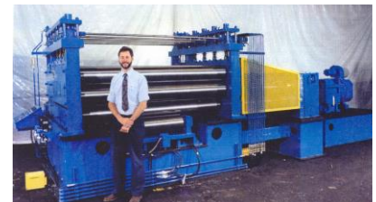
78" x 8" x .500" to .062" Flattener/Leveler