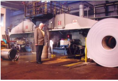
42" 10-High Light-Gauge Reversing Rolling Mill, 4" Diameter Work Rolls