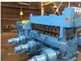
84" x 3.5" x 17-Roll x .250" to .100" Voss Corrective Leveler w/Drive