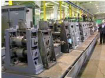
1.5" to 5" OD x .375" Wall Turek & Heller Heavy Wall Tube Mill w/Double Uncoiler