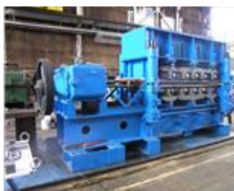
84" x 3.5" x .375" to .100" Aetna-Standard Corrective Leveler