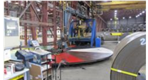
72" OD Rotary Banding System