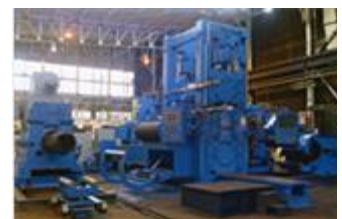
4-High Rolling Mills: For light-gauge aluminum or steel, coil-to-coil.