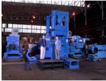
60" x .020" to .250" 4-High Reversing Cold Rolling Mill