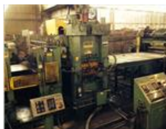
76" x .150" to .020" x 60,000# Voss Double Leveler Cut-to-Length Line